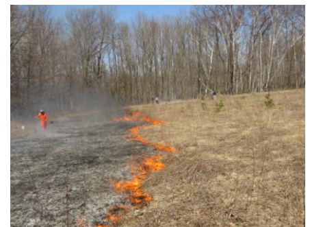
Prescribed burn underway at Pelton