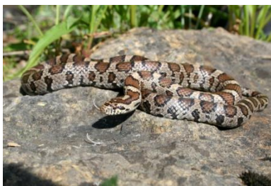
Eastern Milksnake

invasive shrub, for which the student team went on to collect GPS coordinates. A team of volunteers and members of the NLT Stewardship Team has already used these to locate some individuals or clumps and cut them down. Additionally, invasive Phragmites and Dog-strangling Vine were found along the property borders. The team made recommendations for the management of these particular invasive species.